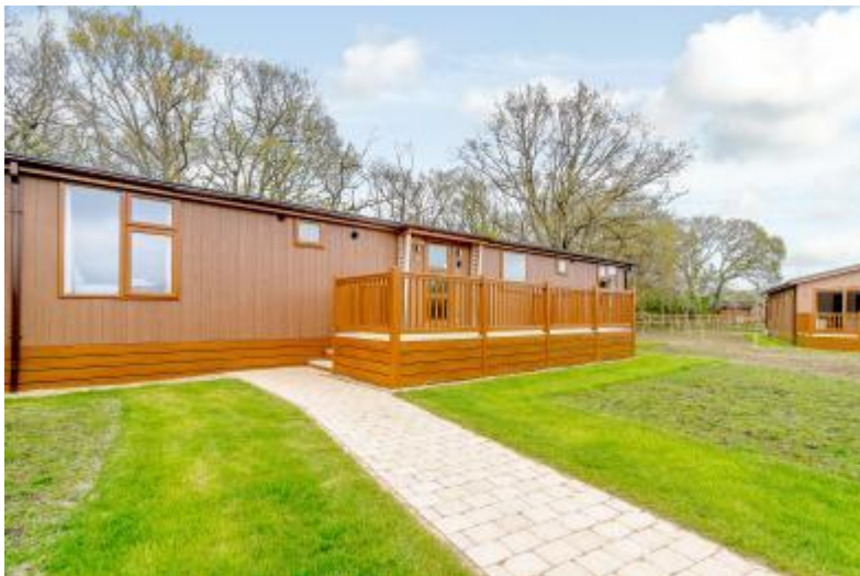
Outside a 4-bed lodge