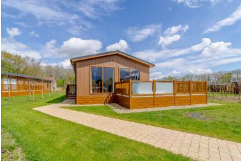
Outside a 3-bed lodge