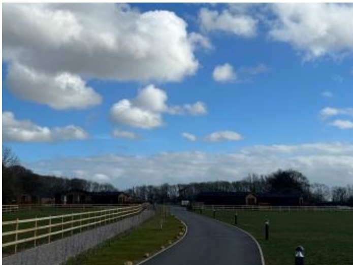
Low lighting for roads