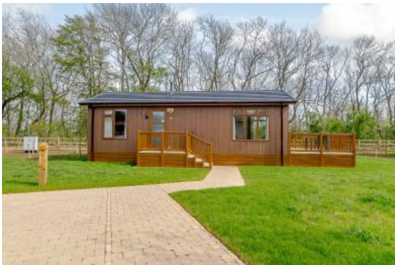
Outside a 1-bed lodge