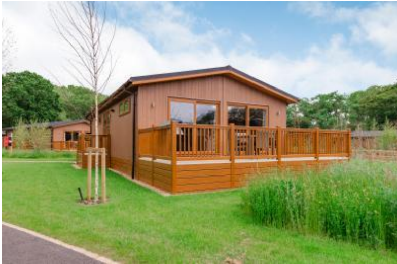
Outside a 2-bed lodge